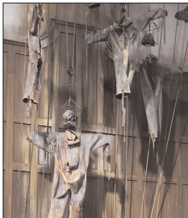
Miners’ suits recovered from Silent Hill fire.

beautiful hotel allowed to rot like that,” McCabe says. “But it’s good that people just stay the heck away from that place.” ■